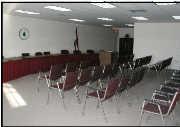
Banquet Style Seating